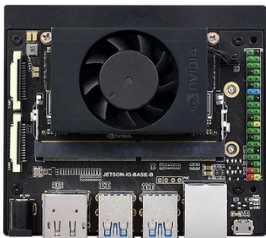
The Top View